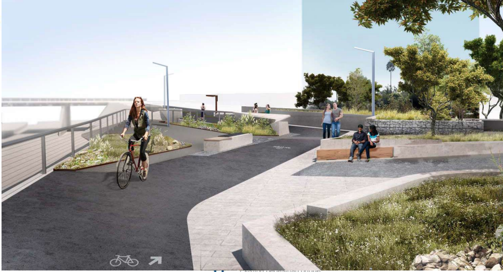
Existing pedestrian bridge New Bridge